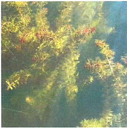
Eurasian milfoil ( Myriophyllum spicatum )

The Indianhead Lake improvement program will include the select use of aquatic herbicides to control aquatic plant growth. The plant control program will focus primarily on invasive species such as Eurasian milfoil and curly-leaf pondweed.