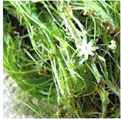
Starry stonewort ( Nitellopsis obtusa )