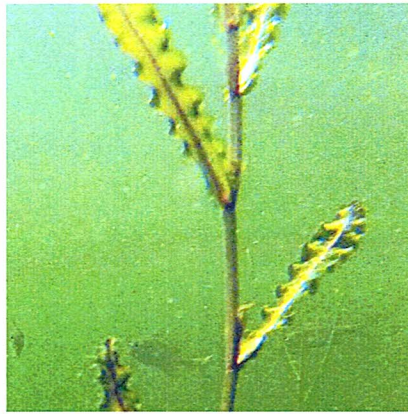
Curly-leaf pondweed ( Potamogeton crispus )